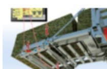
On The Go ActiveWeigh™ System