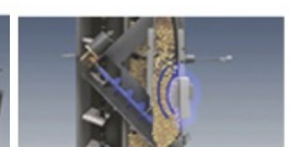
Real Time Combine Moisture Sensing